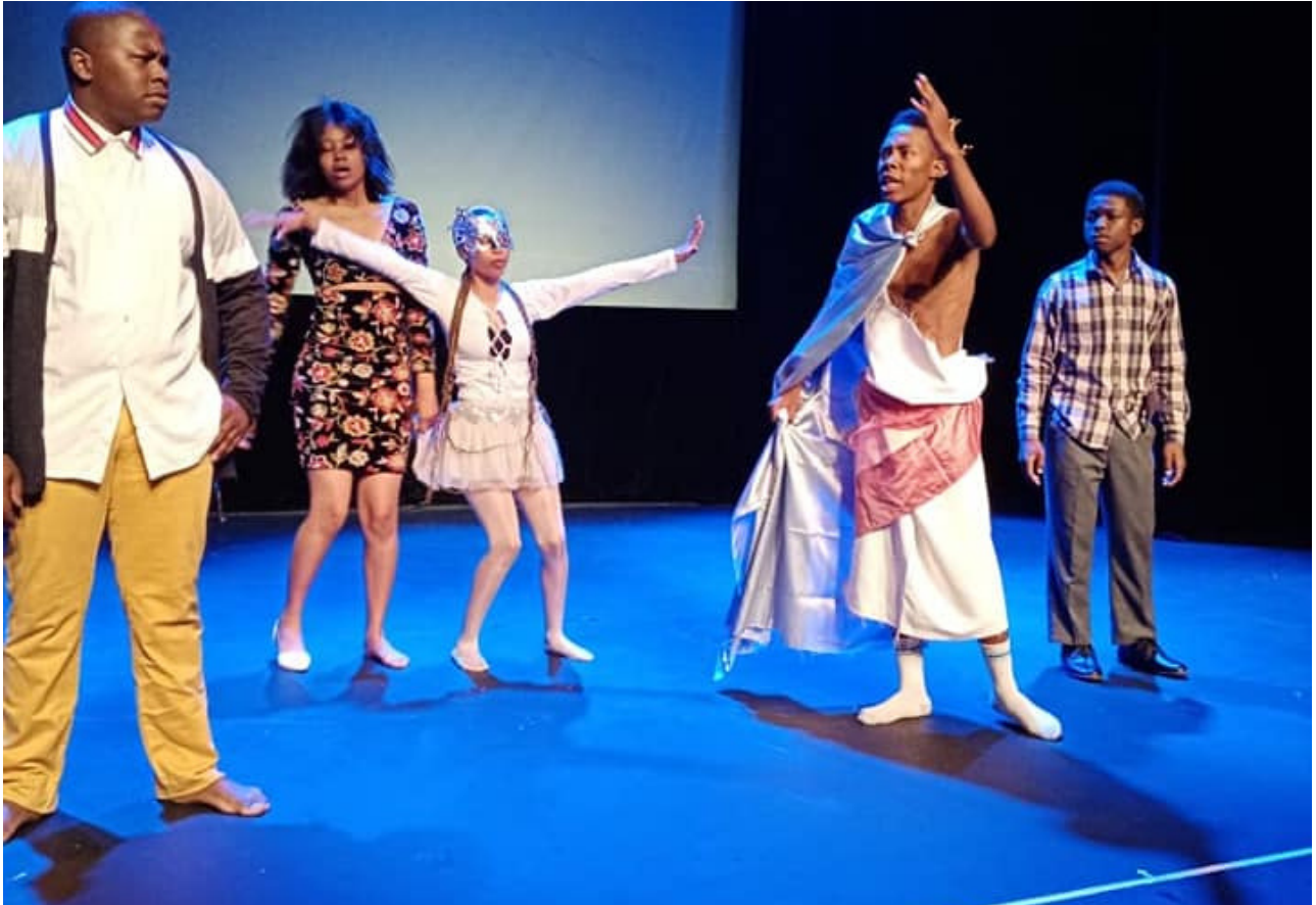
The cast of the play performing at the Joburg Theatre.