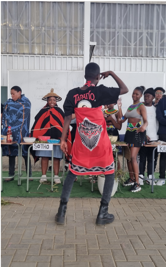
The grade 10 class representing the heritage of the Gauteng province.

The Grade 11's won as they presented a stellar performance. The grade 10's came in second place and the grade 9 class secured the number three spot.