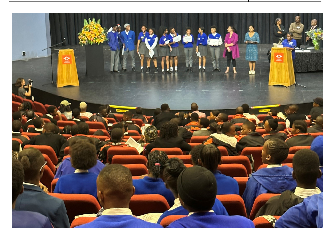
The ASE scholars, teachers, AccessEd tutors and UJ staff at the Sanlam Auditorium at the University of Johannesburg.